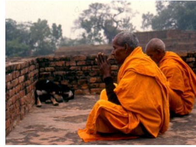
Vulture Peak in Rajgir