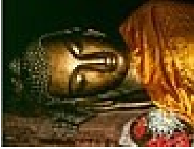
Reclining Buddha at Kushinagar