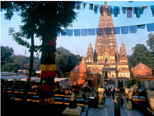
Bodhi Temple, Bodhi Gaya